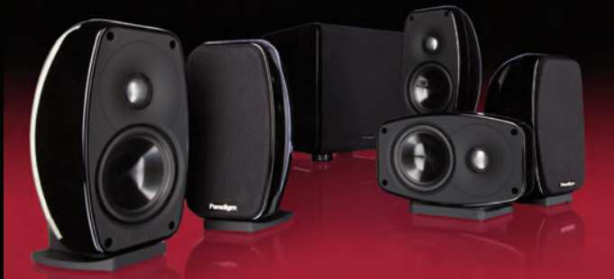
Cinema 100 CT: 5 x Cinema 100 satellites • 1 x Cinema Sub

Cinema CT Systems in home theaters summer 2011 ▼