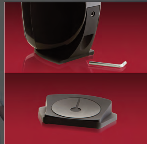
Table-top stands included with Cinema 100