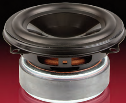
The Bass/Midrange Driver