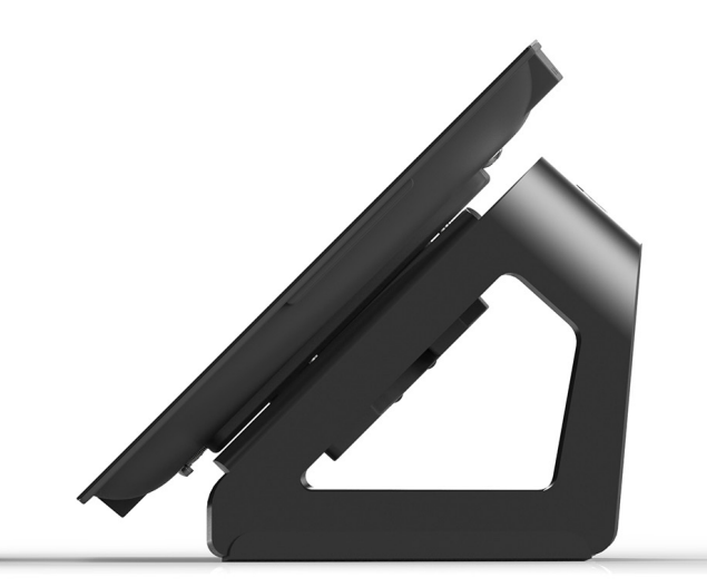
The Tabletop Stand is sold separately