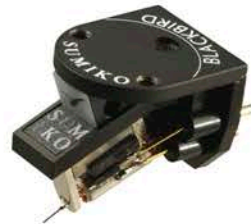
BLACKBIRD LOW OUTPUT

By offering a low-output version of the Blackbird at 0.7 mV, we have taken advantage of a low-mass cantilever assembly to provide even faster response time and superior dynamics. With the right preamplification, the low-output Blackbird takes all of the performance features of the standard version and pushes them to the next level with the improved tracking that lightweight coils afford.