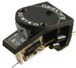
BLACKBIRD HIGH OUTPUT

The classic Blackbird design has a level of performance and clarity that competes with cartridges twice its price: it's been designed for exceedingly low noise levels, exceptionally wide dynamic range, and the highest possible fidelity. In its high output version it can be paired with almost any MM phono stage: top class music presentation meets versatility.